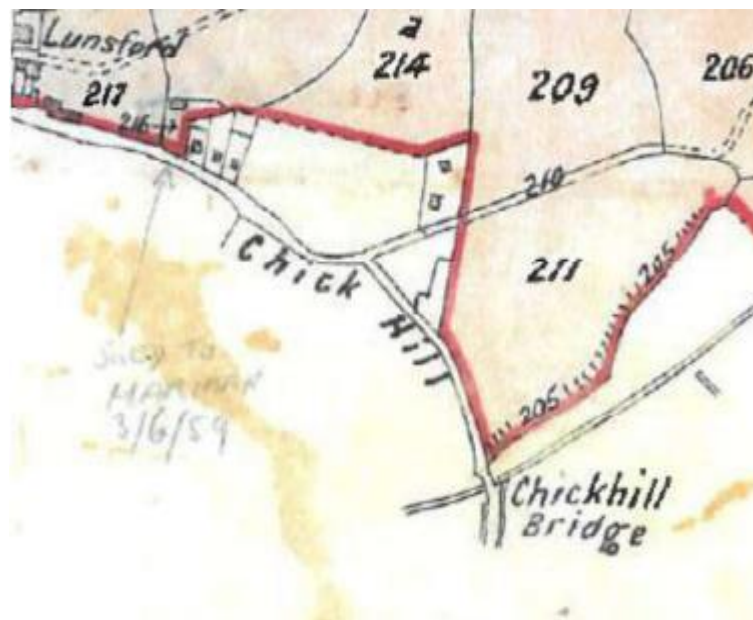
Figure 4: magnified extract from the conveyance plan